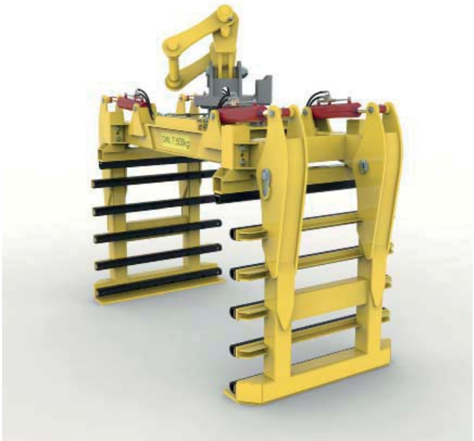
Example: CSG14-05-04 Concrete Sleeper Pack Grab for 25 sleepers with rotator and two-pin adapter head

The device may be specified for one to five layers of sleepers to suit different host machine capacities.