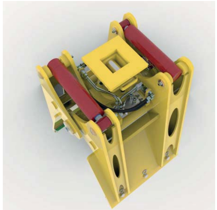
Example: PG14-03-05 Plate Grab with 800mm deep jaws and Archimedes square drive adapter head

The device may be specified with our full range of adapter heads for excavator or truck crane mounting.