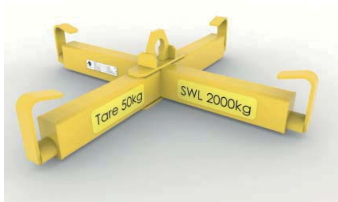
Example: BC07-02 1000mm Bag Carrier

Either model can be used for handling bulk bags up to 2000kg. The larger model is also used to hold bags open for loading.