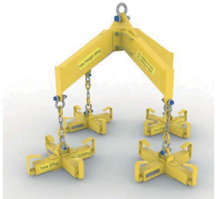
Example: MBC14-03-01 Four Leg Beam with two removable legs equipped with 600mm Bag Carriers

The Bag Carriers suspended from the centre beam can be either 600mm or 1000mm types.