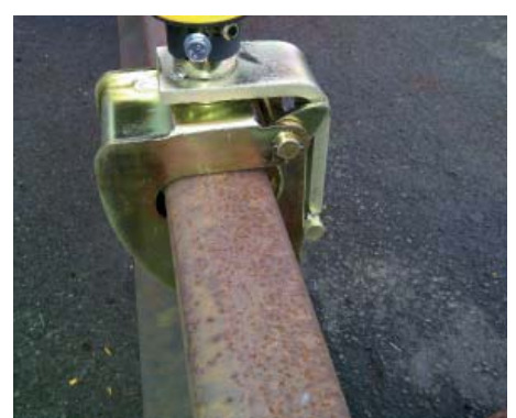
Specifications given may be subject to change due to our policy of continuous improvement